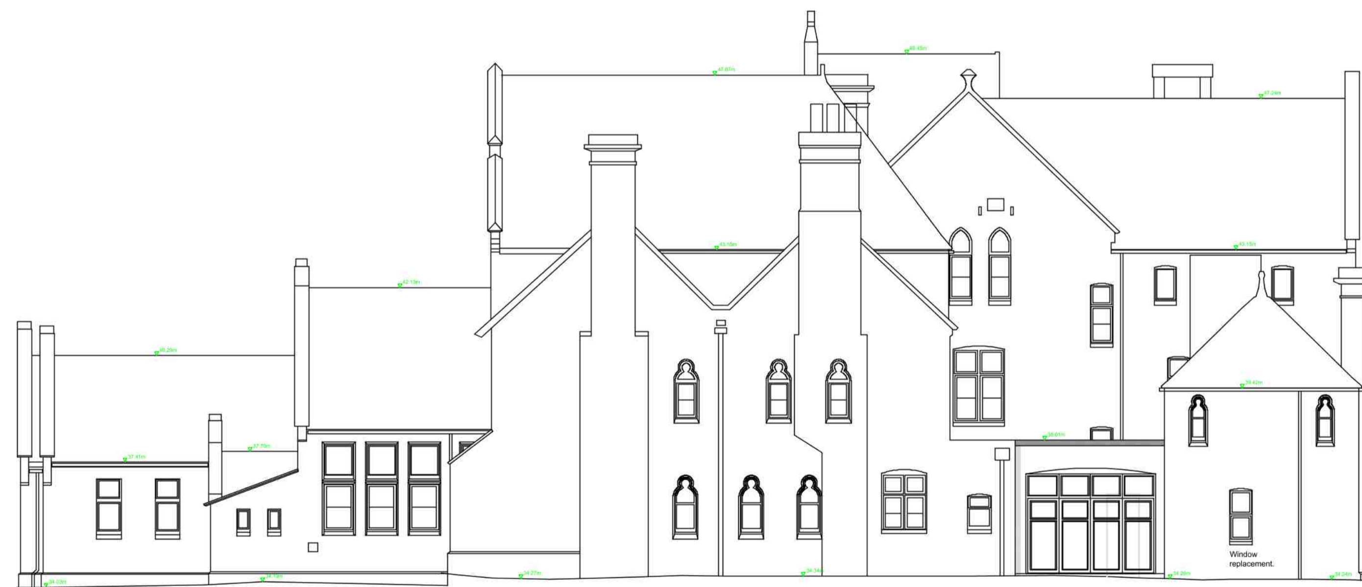
30.000m AOD Elevation 4