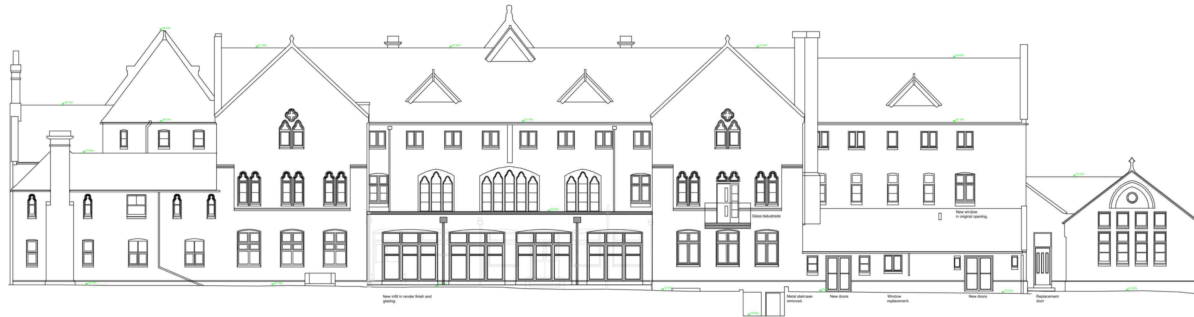
30.000m AOD Elevation 3